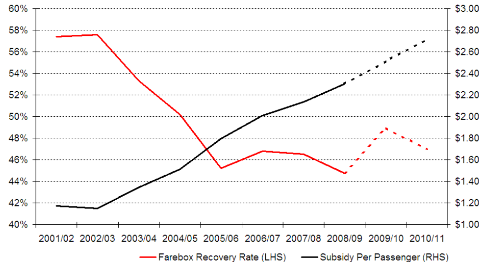
Fare Recovery vs Subsidy Per Passenger