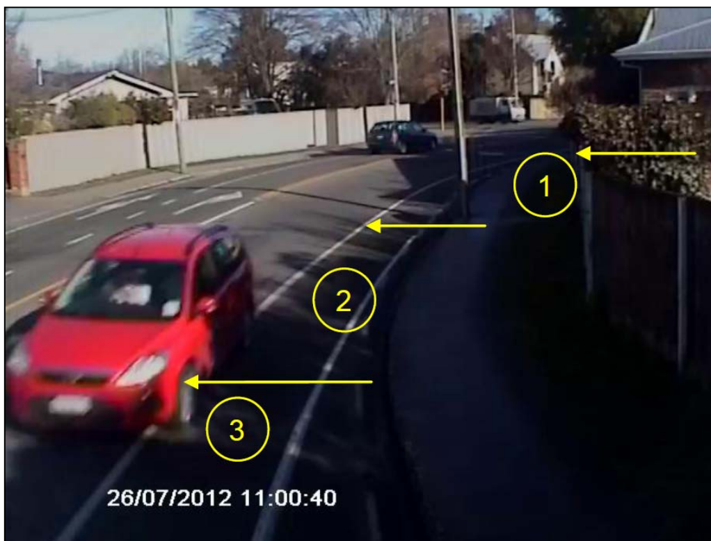
Figure 6: Partly encroaching motor vehicle in Section 2+3 (Kotare Street)

Some unusual behaviour was noticed when a motorist encroached in Section 1 while overtaking another vehicle that was waiting to turn into a property. Another unusual encroachment of Section 1 was by a motorist making a u-turn.