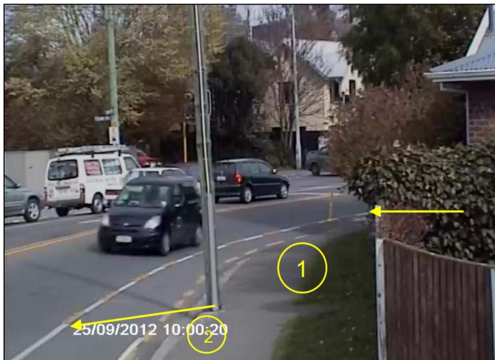
Figure 4: Kotare Street encroachment zones as viewed from camera

Vehicle movements were categorised as fully or partly encroaching into any of these sections. Motor vehicles were rated as fully encroaching, when they were taking all space from cyclists. If motor vehicles entered the cycle lane with one wheel or drove on the cycle lane marking, they were categorised as partly encroaching.