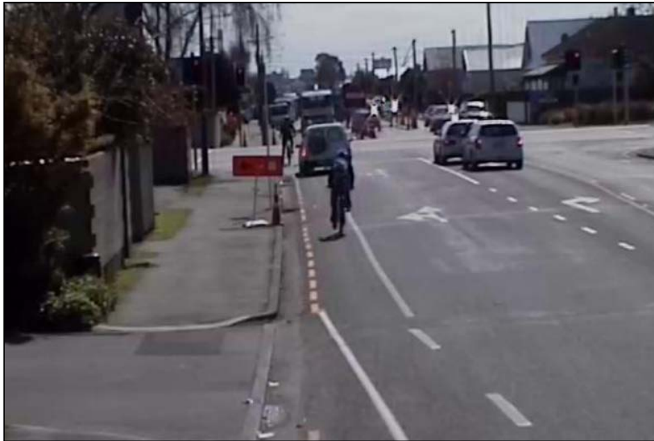
Figure 5: Full encroaching motor vehicles while cyclists present (Strickland Street)

During the survey period, 51 cyclists were counted, with most appearing during the first hour of observation. In general, only half of the cyclists were biking inside of the cycle lane. Of the cyclists outside the cycle lane, the majority used the through-lane to get across to Antigua Street, despite the road closure.