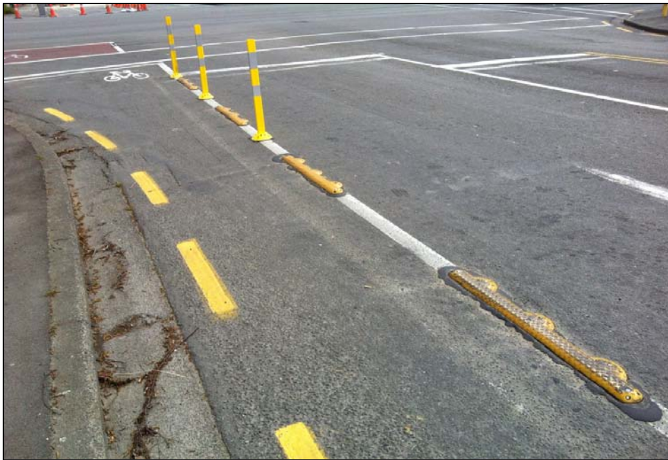
Figure 2: Strickland Street Riley separators and posts approaching intersection

For the road user behaviour study, video data was collected at different stages of the separator implementation using a camera on top of a parked vehicle near each research area. All the surveys were carried out between July and October 2012. Prior to the surveys, the cycle lane on Strickland Street was slightly widened; it was anticipated that separators might become necessary and the researchers wanted to maintain adequate cycling space. This minor treatment was considered not influential to the resulting observed road user behaviour.