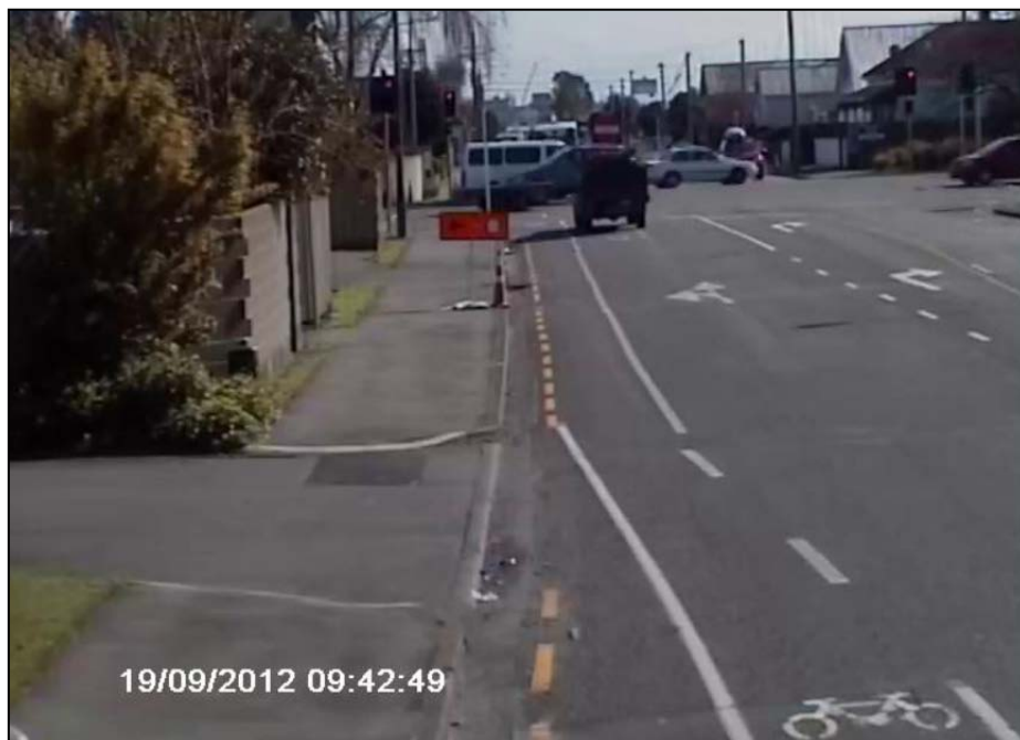
Figure 3: Camera angle, first post-implementation survey (Strickland Street)

The first survey was observed from a side-on position that provided good detail at the intersection, but little about the approach. During the first post-implementation survey, the position of the observation vehicle was changed to get a better impression of the queuing behaviour of approaching vehicles (see Figure 3). While the categorisation of driver behaviour remained unchanged, the cyclist waiting area was not clearly visible and, often, the encroachment level of vehicles in this area had to be guessed.