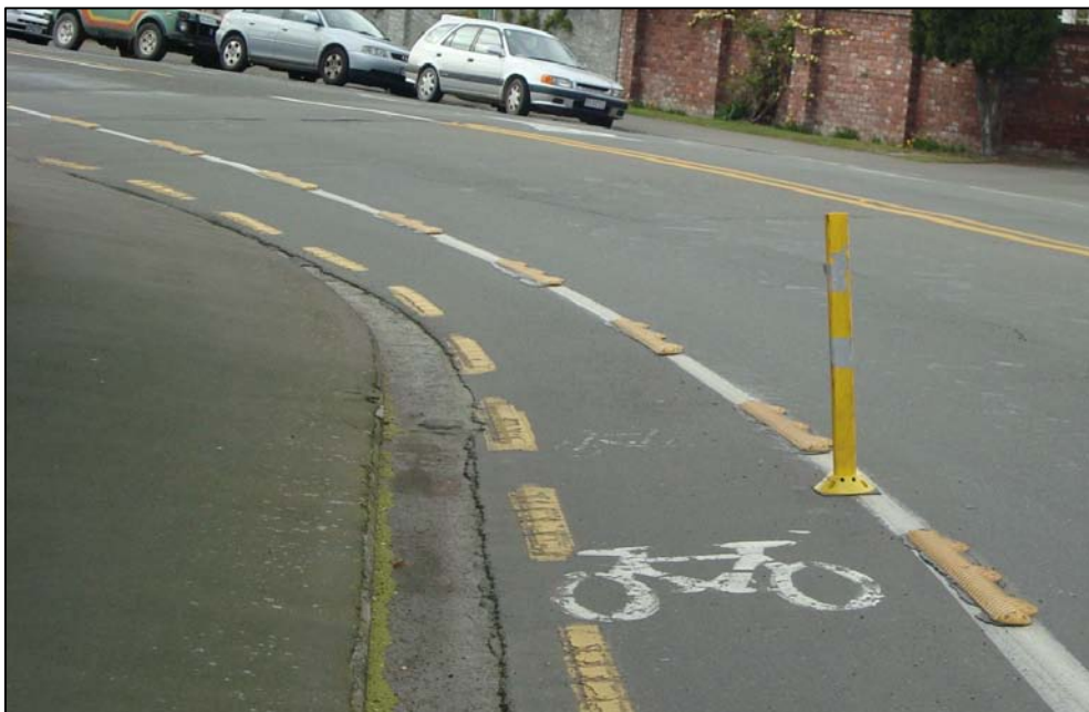
Figure 1: Riley separators and a vertical post installed on Kotare Street cycle lane line

The field work was undertaken from July to October 2012 on two street sections in Christchurch, which are known for motor vehicles encroaching into the existing on-street cycle lanes. One of the street sections was a road at a major intersection that contained two approach lanes and a kerb-side Advanced Stop Lane (ASL). The other street section included a slightly curved mid-block area with a kerb-side cycle lane. Christchurch City Council provided site support and video data collection and the University of Canterbury helped to analyse the results (Aussendorf 2012).