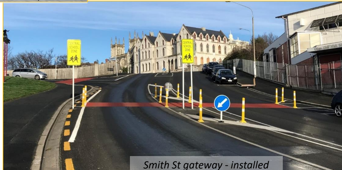
Smith St gateway - installed