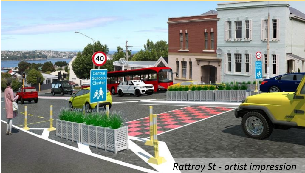
Rattray St - artist impression