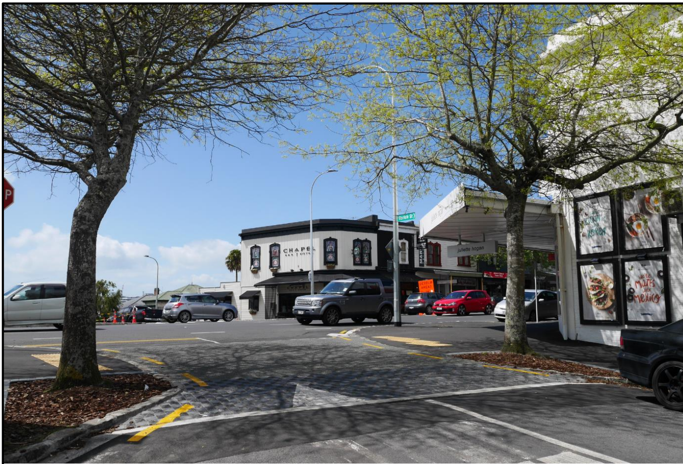
Upgraded Norfolk Street/Ponsonby Road intersection