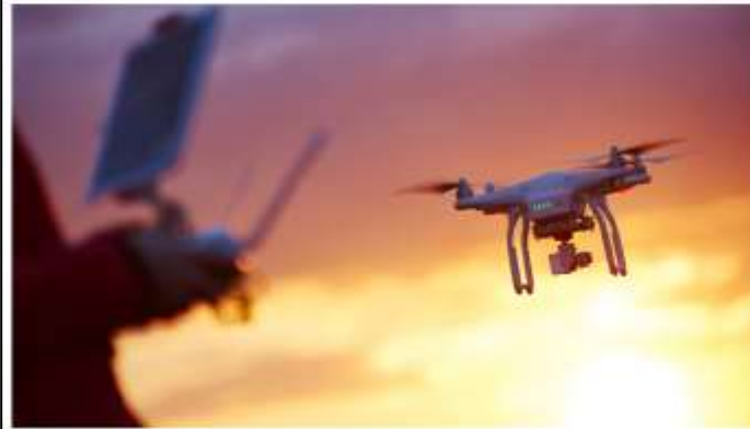
The drone sighting sparked incoming flight delays.