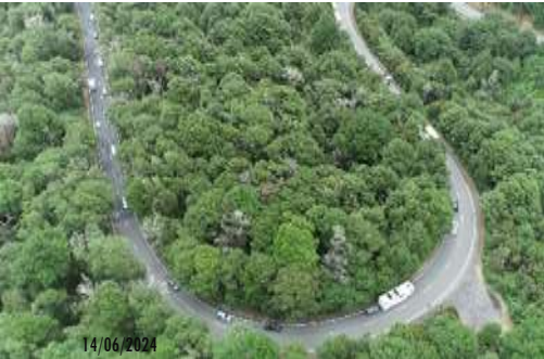
Queue of northbound traffic behind slower vehicles