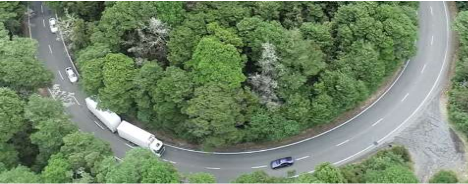
Southbound vehicle close to the centreline