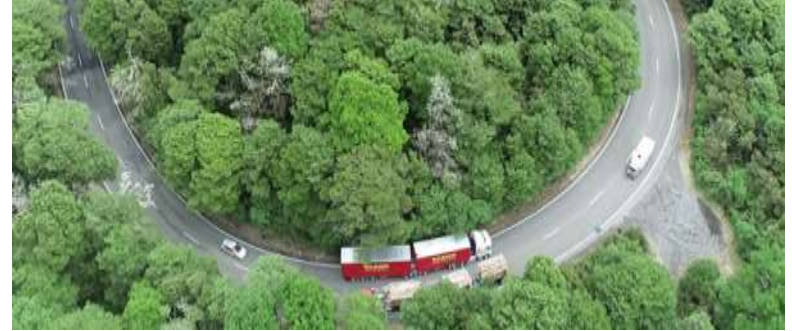
Northbound vehicle close to the cut face