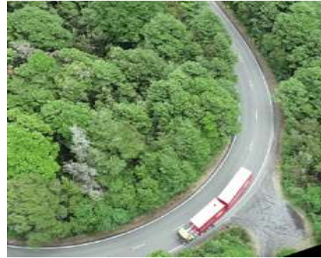
Southbound HCVs unable to stay within the lane