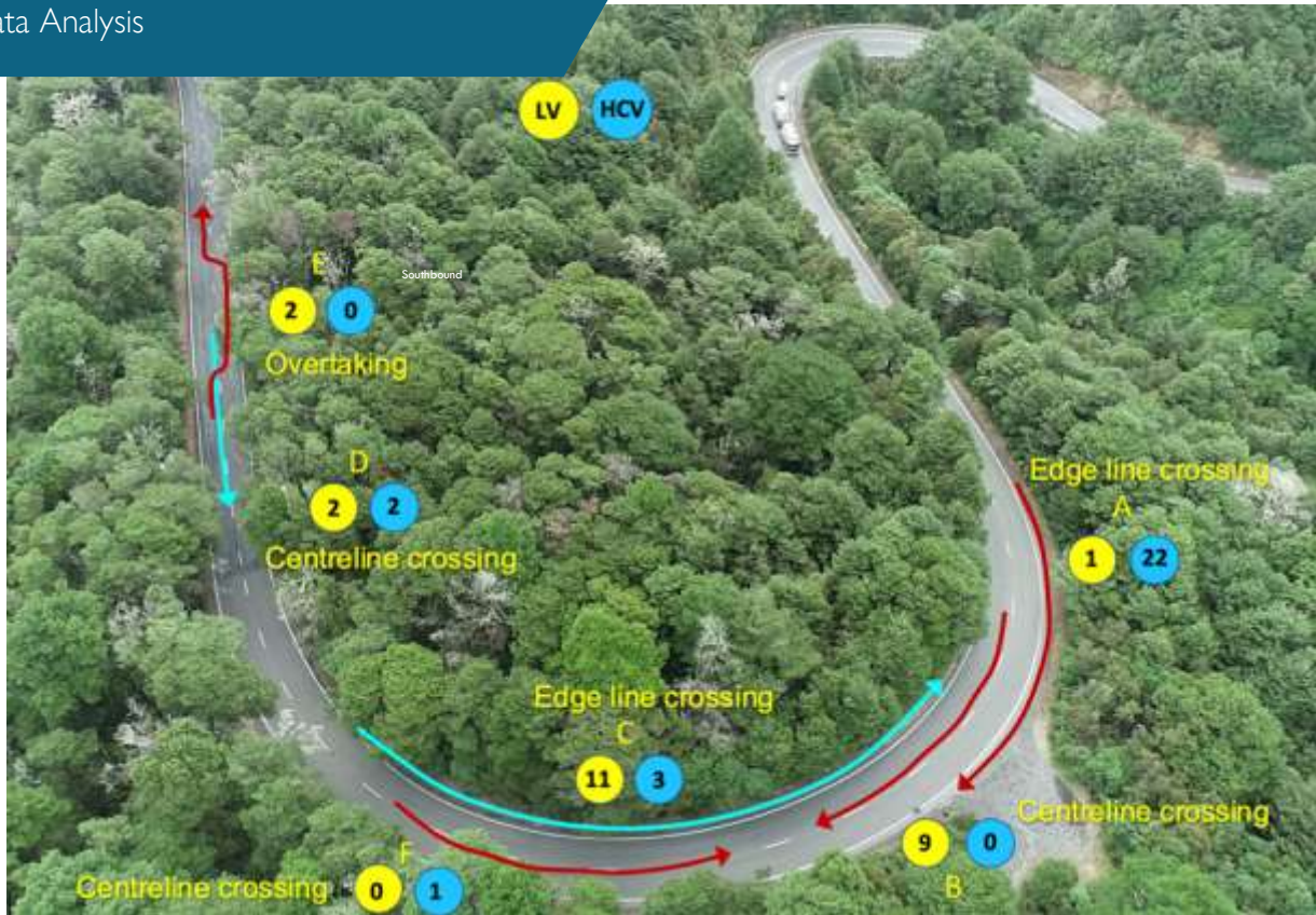
Behaviour Observations Map – Frequency